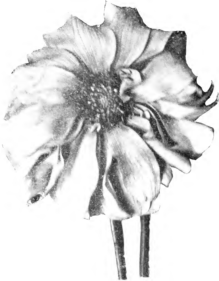
A New Peony Seedling